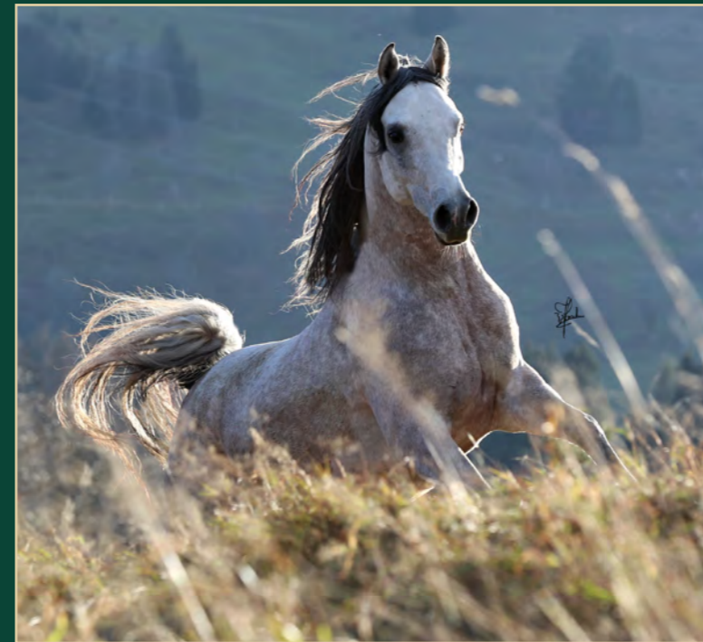
Nile Pasha Halim (Ansata Nile Pharao x Nagda Halima)