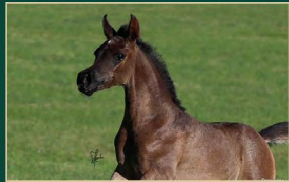
Two fillies by DF Nafis, born 2022

Maya: My aim is to breed refined horses with good, solid bodies. It is just my type, I guess. I like horses that I can ride. None of my horses are garden ornaments. Once my babies are sufficiently grown up, I have them trained to be great future riding horses until I find a wonderful 5-star-home for one or the other. Functionality is just as important as type in my opinion, and I don't breed mainstream show horses. That doesn't mean that my homebred horses can't be shown – but I don't like the so-called industry with mostly horses who look all the same. I love individuality, I love being a bit different. So, I prefer to attend shows like the Noble Straight Egyptian Breeders Festival, which Mahmoud Anzarouti initiated 2017. That's an event that brings together breeders, Arabian Horse lovers, and enthusiasts from all over