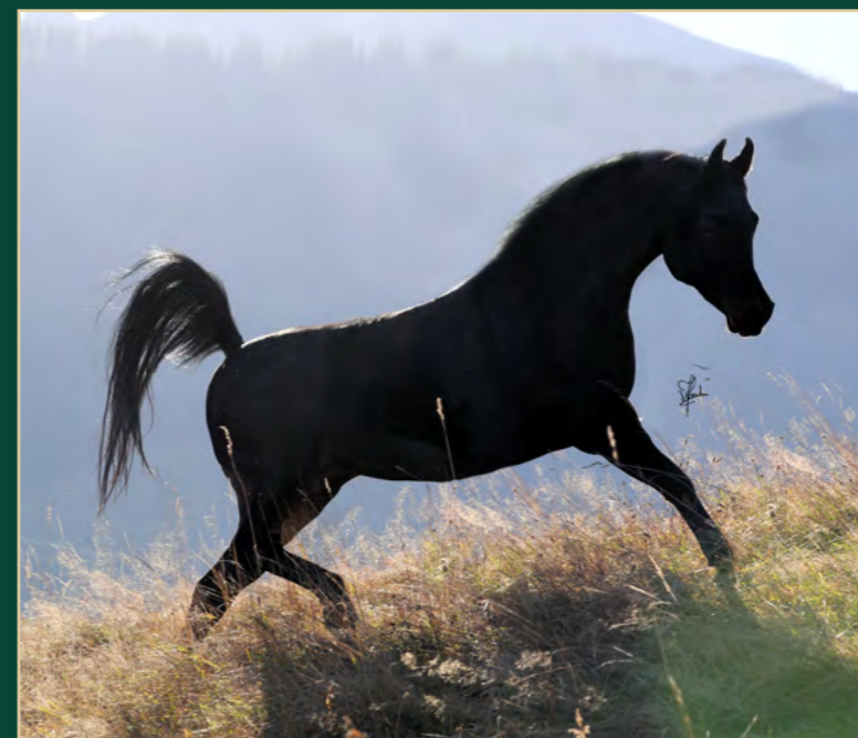
King of the Mountains: homozygeous black stallion HAR Baarez

In the writings of the Orient experts of a few hundred years ago, there are comments about the Abayyans to be found: they were described as being similar to the Saqlawi; beautiful, elegant and showy with a high head and very good tail carriage, the legs of a racehorse and a wonderful shoulder with enormous ribcage and with great speed, agility and adequate endurance. I believe they are the original jewels of the desert. And because history has shown that the Abayyan cross well with other