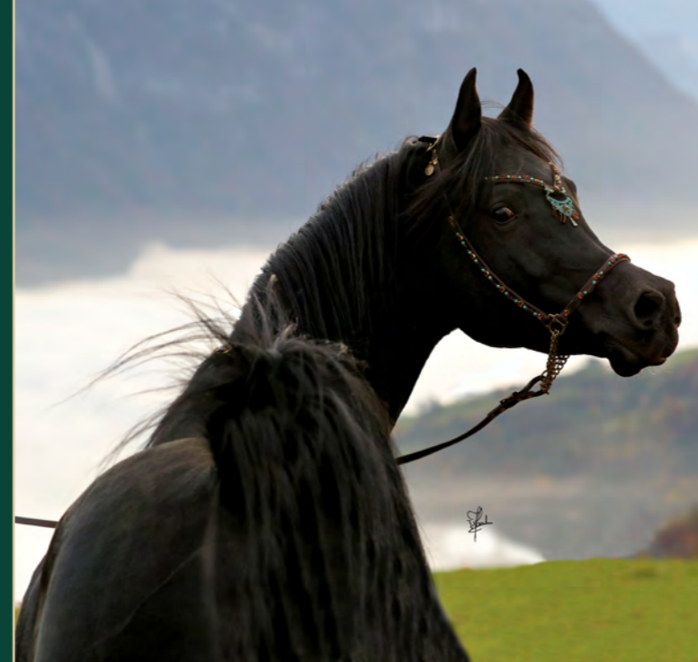
Stallion HAR Baarez overlooking the Valley down below

them bred by the Shammar and Tahawi Bedouins. They are the Abayyan Seheyli, Abayyan Sherrak, and Abayyan Um Jurays, sometimes spelled Abayyan Om Grees or also called Obayan Om Grees.