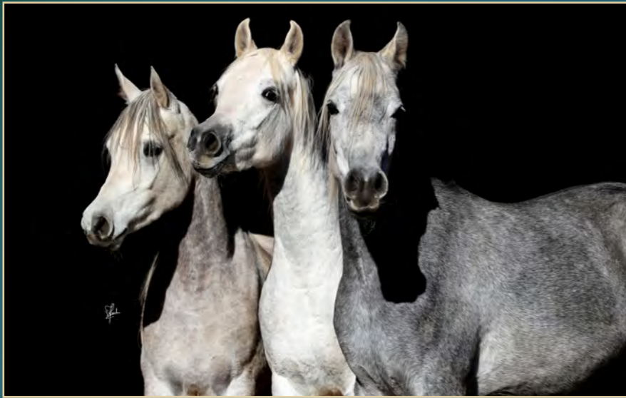
Four year old mares of Al Jabal Arabians: Masida Halima, Jumanah Al Jabal, Rayyanah Al Jabal