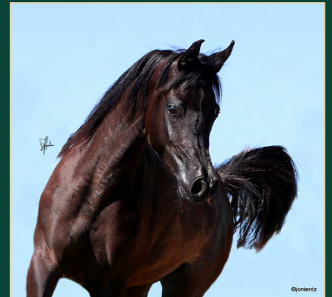
HAR Namira. HAR Baarez daughter

strains, especially the Saklawi strain, I started about ten years ago to outcross my mares with mostly Saklawi stallions. I would like to remind everybody of the three most influential broodmares of the last century who were of the Abayyan Om Jurays strain: Magidaa (Alaa el Din x Maysa by Anter), Hanan (Alaa el Din x Mona by Badr) and Marah (Galal x Maysa by Anter).