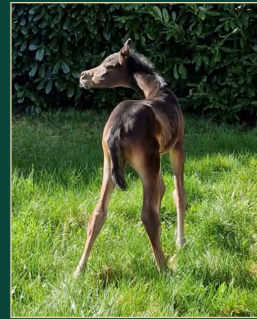
2023 son of HAR Baarez and Rheemah al Jabal