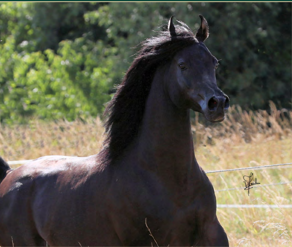
DF Nafis (DF Siraj out of DF Nadeemah by Miad al Shaqab)