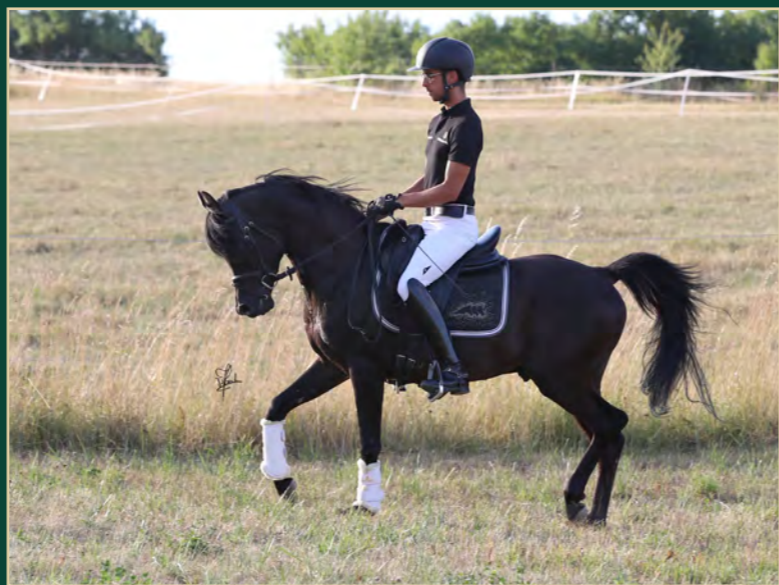
DF Nafis presenting himself under saddle

the world to present their Straight Egyptian breeding programs. These presentations are held in a relaxed and joyful atmosphere, without judgement but with a lot of passion. Most breeders will even present their horses themselves... something you rarely find at mainstream shows nowadays because they are all in the hands of professionals - which is not always an advantage for